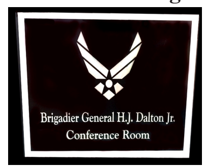
Hint: Turn Page For The Answer

SOF, Tanker acquisition, and mobility, as well many other units, there are a lot of potential tour stops at Wright-Patt.