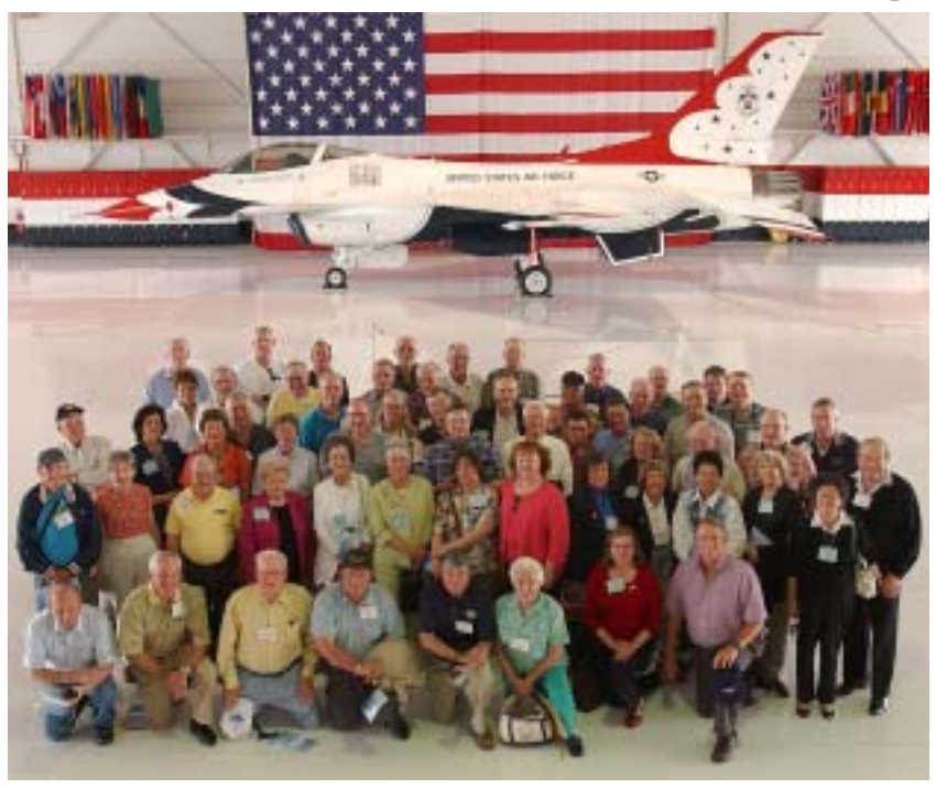
Attendees gathered in the Thunderbird hangar for a group photo