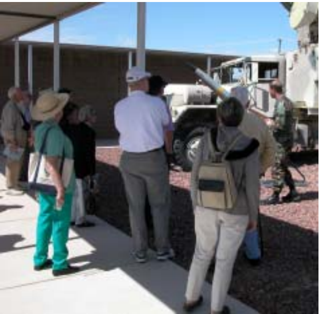
Air Force Public Affairs Alumni Association members listen to a presentation at Nellis' threat facility.

There was a motion to adjourn. It was seconded and unanimously carried by voice vote at 3:25PM PDT.